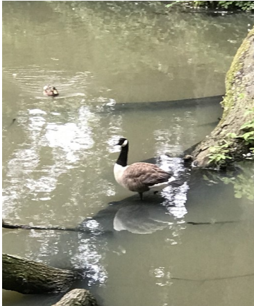
A Canada goose...

What can you spot at Goff's Park pond this summer. So far, our staff have spotted..